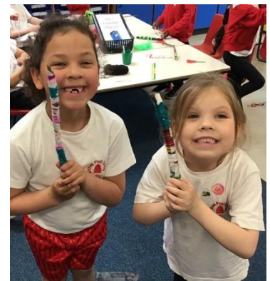
Y1 Creating with Natural Materials.

We have an incredibly busy last half term ahead, with many exciting activities planned and most importantly the opportunity for children to spend time in their new classes- we will miss you all Y4, have the best two transition days, we will look forward to hearing all about it!