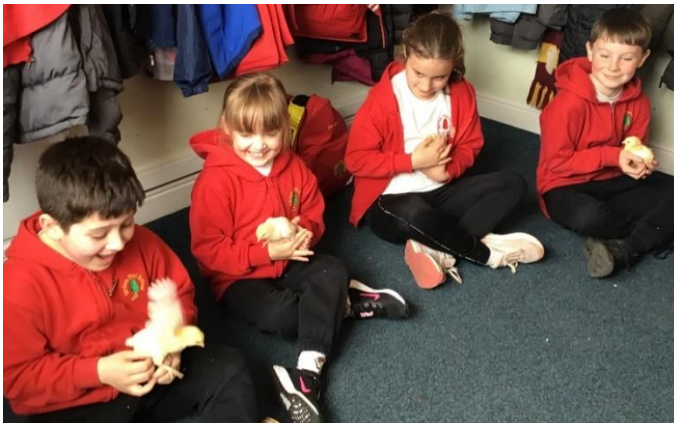
Y3 Enjoying the chicks that hatched.