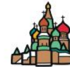
St. Basil's Cathedral Russia